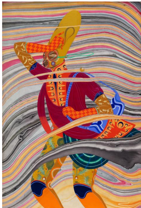
Storm , 2020, mixed media on marbled paper, 76.2 × 61 cm, James McKellar, Photo courtesy of Patel Brown, L2022.77, © Rajni Perera

The exhibition will reward repeat visitors with an unfolding rotation of gems hand-selected from the McMichael's vaults, further extending the inter-generational conversations between art and artists of different eras and styles.