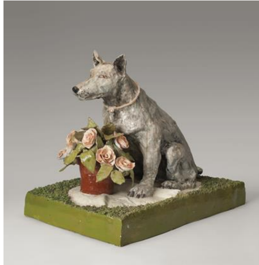
Gathie Falk, Picnic with Dog , c.1976, ceramic, paint media, 60.5 x 47 x 71 cm, Vancouver Art Gallery, © Gathie Falk