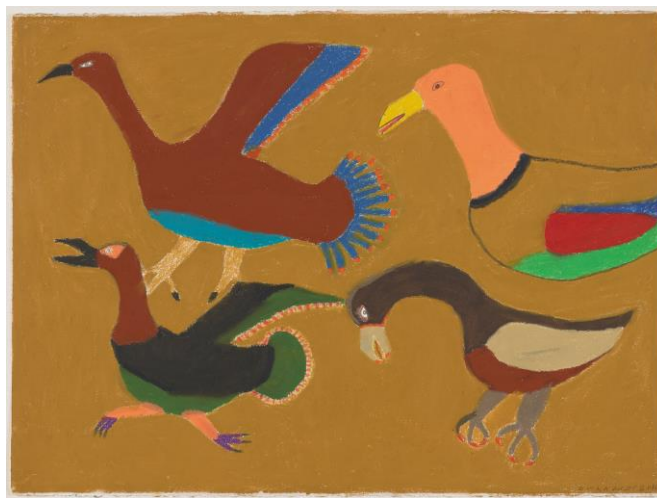
Elisapee Ishulutaq, Untitled (Four Colourful Birds) , n.d., oil stick on paper, 22.25" x 30", Private collection